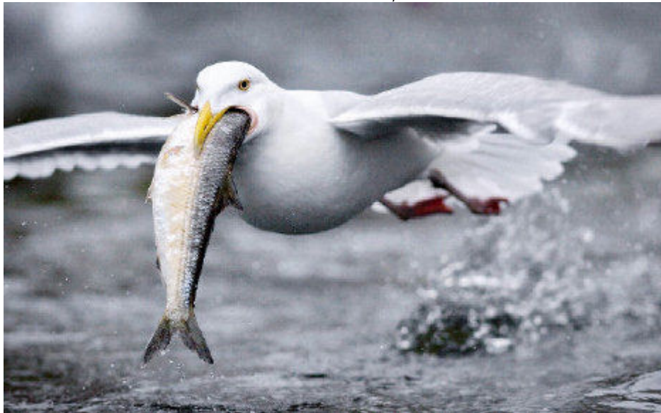
A gull flies off with an alewife, plucked from the waters of the river at Nobleboro, Maine. The annual alewife-run provides easy pickings for gulls, ospreys and the occasional bald eagle.

The biggest lesson from Penobscot could simply be the age-old piece of wisdom: prevention is better than the cure. Purchasing and decommissioning the Penobscot dams is going to cost $50 million; it may have been cheaper not to build them in the first place.